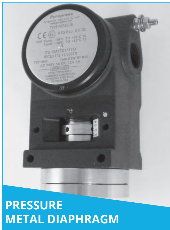
PRESSURE METAL DIAPHRAGM

The Perseus range has separate electrical and adjustment chambers meaning that set point adjustment can be carried out with the power on and the switch in operation. The stainless steel housing is available with one or two electrical entries.