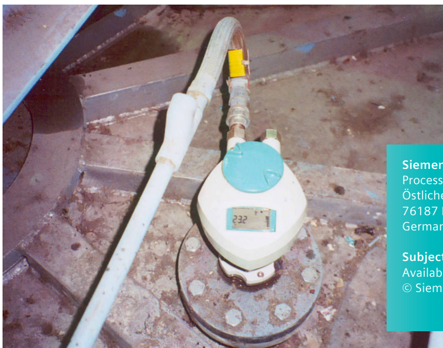
Fig. 4: Siemens has taken the experience of how to differentiate between false echoes and true echoes from over a million individual applications, and distilled it into the "Process Intelligence" software that goes into each one of its radar devices, like this Sitrans LR200 unit.

One thing is clear though: cement is an industry that embraces new technology, which has certainly been the case with the introduction of a 78 GHz radar level measurement device with a narrow beam. This new radar technology isn't affected by dust, vapour, or temperature, and can effectively measure solids, even those with a steep angle of repose. Since its introduction in 2011, cement producers have collectively rushed out to adopt a product that, because it can be applied in virtually all areas of the cement plant, is one of a kind.