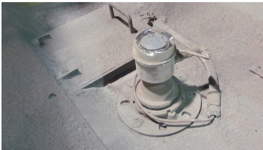
Fig. 2: The Sitrans LR560 is the ideal radar device for dusty environments. In addition, it emits a short wavelength (78 GHz), so is able to accurately measure the level of solids, even when the material is piled on a steep angle.

"These instruments were easy to install and set-up, and they have been working fine."