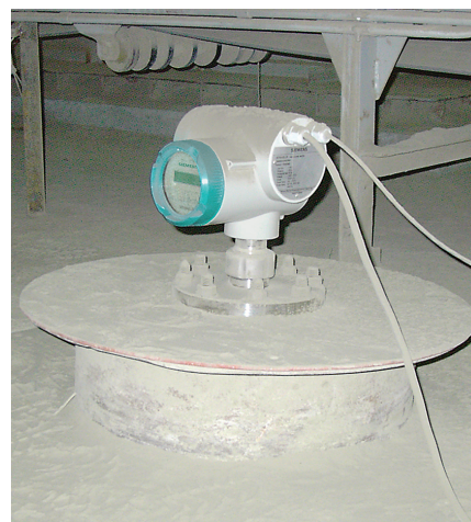
Fig. 3: Sitrans LR400 units such as this one were installed well over a decade ago, and continue to provide reliable level measurement readings to this day.

A major cement plant in Texas has learned the hard way that, when the