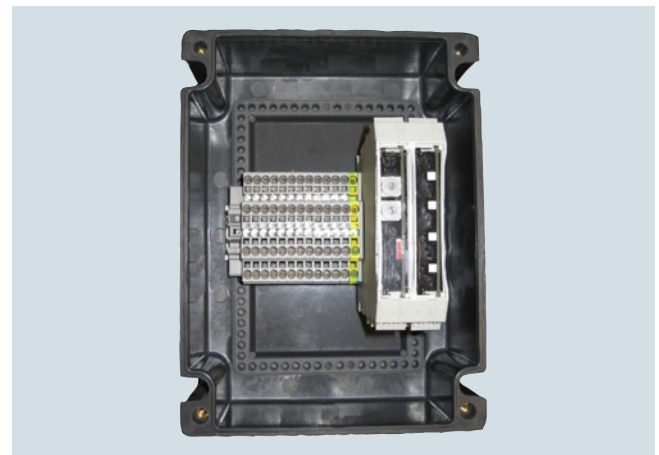
Box with I/O Extender

Standard calibration gases for system test and run-out