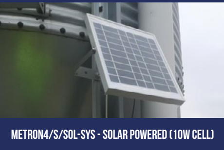
METRON4/S/SOL-SYS - SOLAR POWERED (10W CELL)