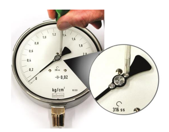
Figure 2: Zero-point correction

Similarly, a displacement of the zero point caused by use and long service life can be corrected if necessary.