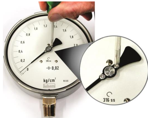
Figure 3: Zero-point correction

Similarly, a displacement of the zero point caused by use and long service life can be corrected if necessary.