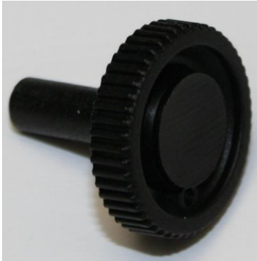
Figure 1: Key

Setting the contact can be done by using the adjustment lock in the centre of the sight glass. Just press down the separate or permanently mounted key (Figure 1) until the pointer of the lock catches the adjusting pin of the contact (Figure 2).