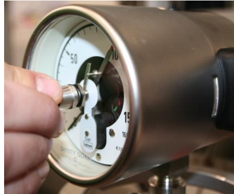
Figure 2: Setting the contact

The set pointer can be adjusted over the entire scale range. It must be ensured that the contact will be set in a clockwise direction only. If the contact is accidentally set behind the desired value, turn back the contact at least 5% below the desired value and make the setting again in a clockwise direction.